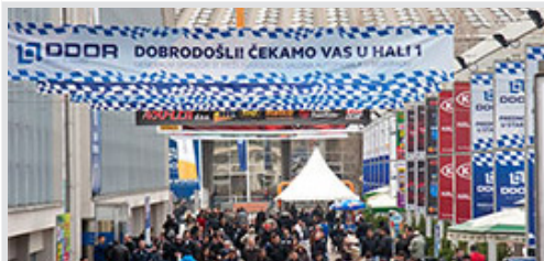
Colonnade in front of the Hall 2 vinyl 8x1 m, incl. 4 billboards, 95x195 cm 580 €/piece pcs.