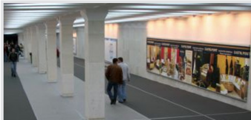
Megaboard, Underground Passage, 995x195 cm, paper, illuminated 520 €/piece pcs.