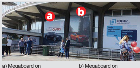
a) Megaboard on Hall 1, 6x6, vinyl 1.600 €/piece pcs. b) Megaboard on Hall 1, 4x6, paper 650 €/piece pcs.