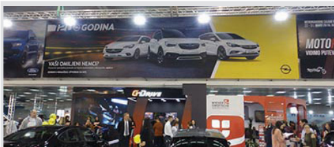
Advertising surface on the vinyl per sq.m. 33 €/sq.m sq.m