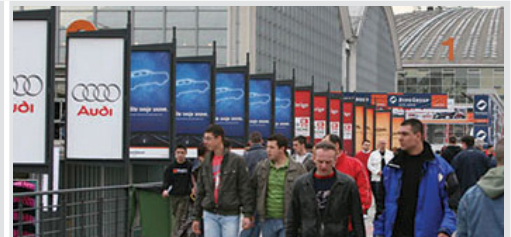
Double sided billboard on the pedestrian bridge, 95x195 cm, paper 105 €/piece pcs.