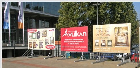
Billboard 300x200 cm, paper 240 €/piece pcs.