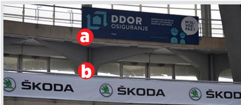
a) Billboard 6x1.5m 170 €/piece pcs. b) Vinyl on railing above the stand 33 €/sq.m sq.m