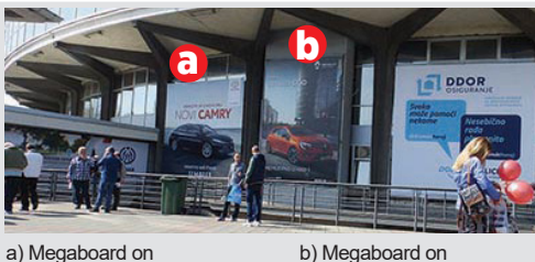
a) Megaboard on Hall 1, 6x6, vinyl 1.600 €/piece pcs.