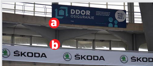
a) Billboard 6x1.5m 170 €/piece pcs. b) Vinyl on railing above the stand 33 €/sq.m sq.m