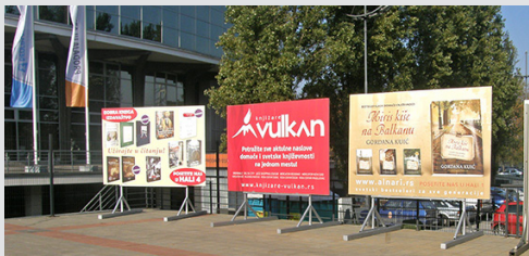
Billboard 300x200 cm, paper 240 €/piece pcs.