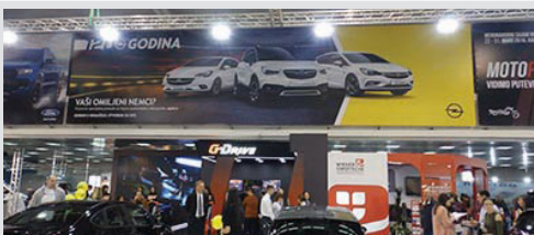
Advertising surface on the vinyl per sq.m. 33 €/sq.m sq.m